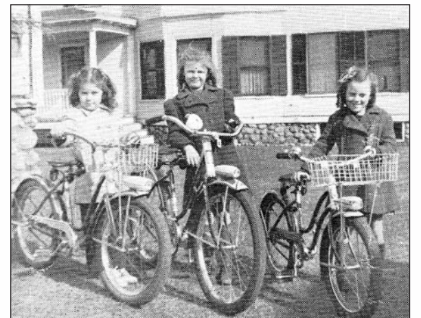
Frequently Seen Around Town

The new truck road on the back side of the river from Camp 4 site to Camp 8 has recently been completed. This road has a gravel base and in places is wide enough to accommodate two trucks, thus