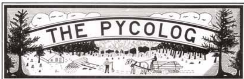
A WEEKLY FEATURE FROM THE WHITE MOUNTAIN SHOPPER