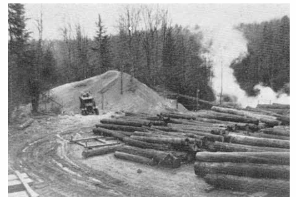
LOGS AT JACKSONVILLE YARD