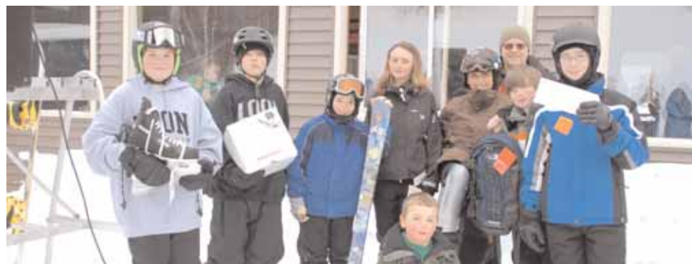
2011 Kanc-a-thon Winners