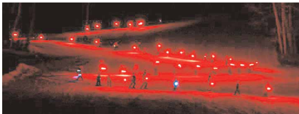
Torch Lite Parade 2011