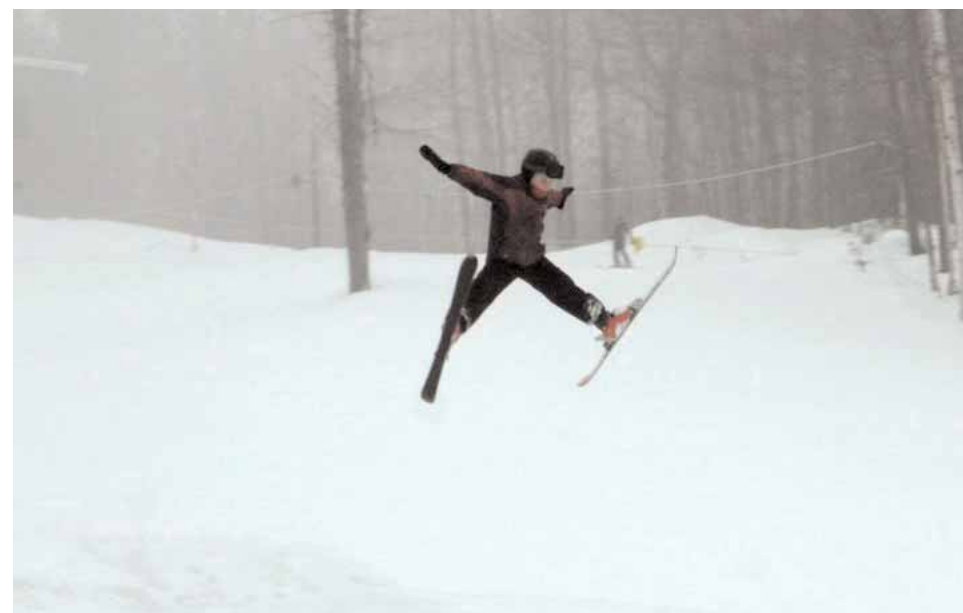
Big Air 2011

Congratulations to all of our winners. Thank-You to our helpers & for your donations!