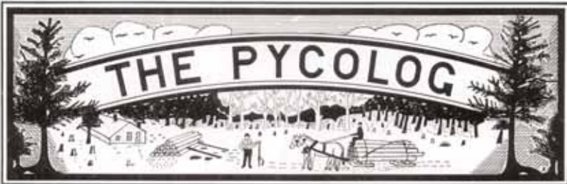
A WEEKLY FEATURE FROM THE WHITE MOUNTAIN SHOPPER