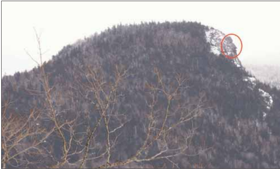
Profile on Imp Face Mountain

my skis, a tedious trudge was transformed into an exhilarating glide!