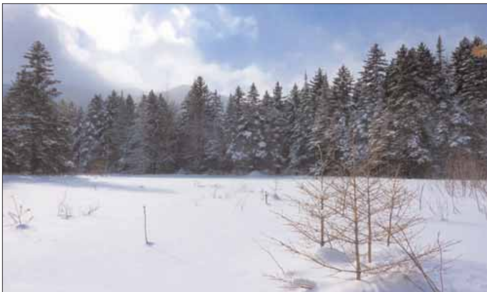
Secluded Pond off Presidential Rail Trail

As indicated at the beginning of this article, I don't wish to over-glamorize my skiing adventures, but they have definitely expanded my horizons by taking me to locations that I otherwise would not have visited. I do feel that the benefits of this sport are significant, and that it is a worthy addition to your winter repertoire. Perhaps this notion is best described by Fridtjof Nansen, the Norwegian Arctic explorer who traversed Greenland on cross country skis over a century ago. In 1890 he wrote: "Nothing gives better presence of mind and nimbleness; nothing steels the will power and freshens the mind as cross country skiing. This is something that develops not only the body but also the soul. It has a far deeper meaning for people than many are aware of."