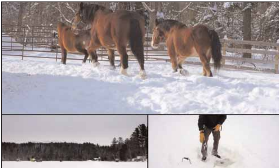
Skiing Near Stables and Ice Fishing Pond

Perhaps the novelty will eventually wear off, but this winter I'm having a wonderful time by combining cross-country skiing with hiking. It's certainly not my intent to over glamorize, oversell, or make this out to be something that it isn't. But I thought it was worth sharing my experience in case there might be others who might have an interest in considering this sport as a way to expand their winter fun.