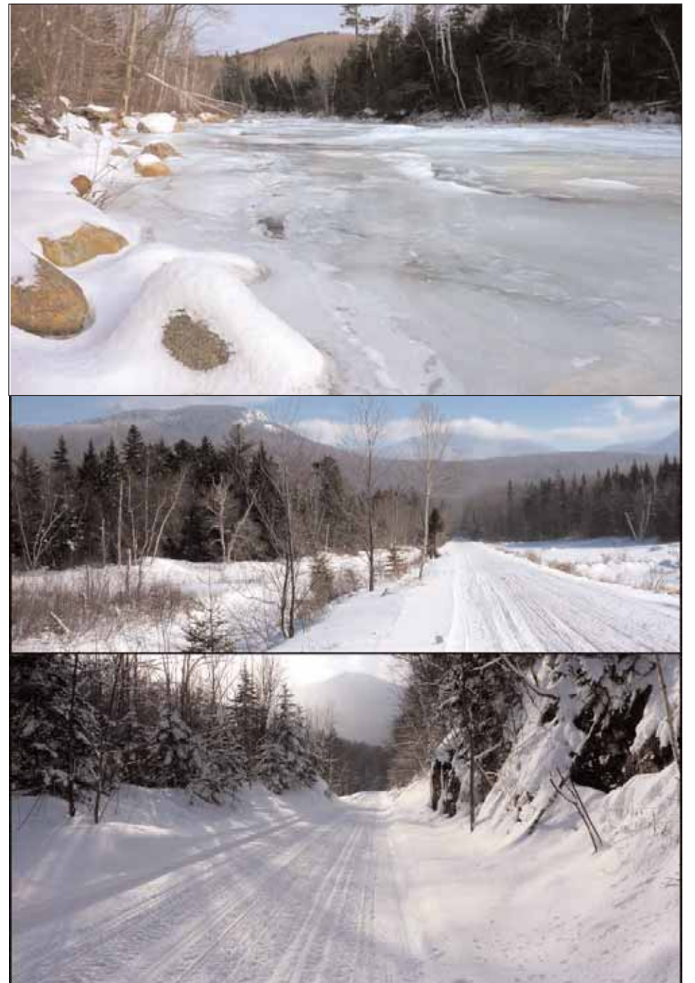
Presidential Rail Trail