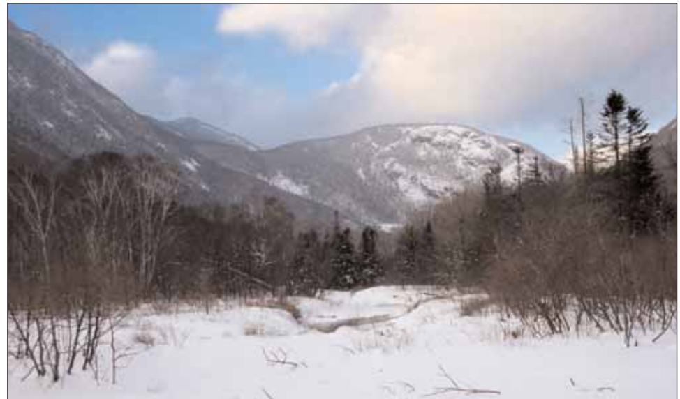
Crawford Notch View from Sam Willey Trail

skied to locations where I launched a bushwhack. On a recent excursion, I skied along the Presidential Rail Trail to a location in Gorham near Pine Mountain. I stashed my skis in the woods and then bushwhacked on snowshoes to a pair of un-named ponds a few tenths of a mile off-trail. The ponds themselves didn't provide any "knock-your-socks-off" views. Nonetheless, the trek to these seldom-visited ponds was a thoroughly enjoyable experience that was facilitated by cross-country skiing. It's highly unlikely that I would have ever slogged along the Rail Trail in snowshoes to visit these ponds. But, by using